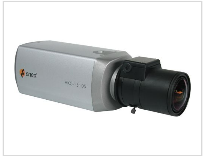
Lens is not included with the camera